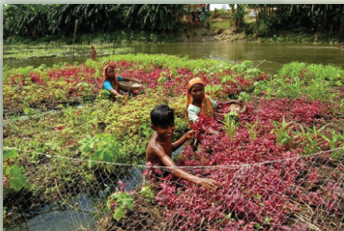
Floating gardens help people grow food during periods of flooding