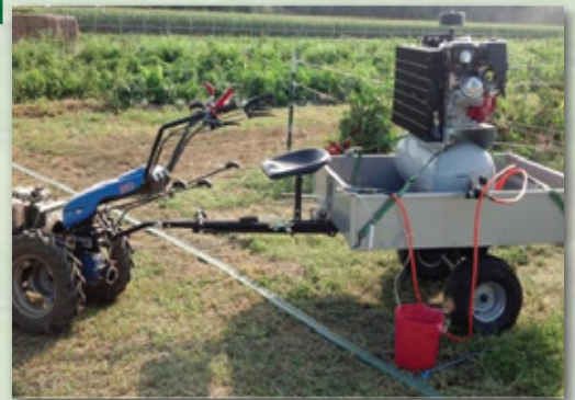
Handheld weed blasting unit used in the study.