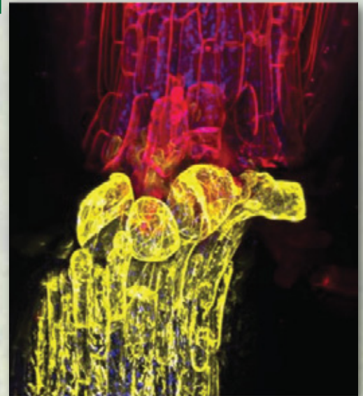
A graft between two genotypes of Arabidopsis thaliana , shown in a confocal microscopy image.