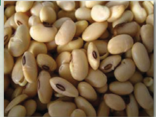
Various types of beans are widely grown across the world.